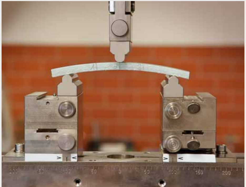
Figure 1: Liner sample undergoing the three-point bendig test