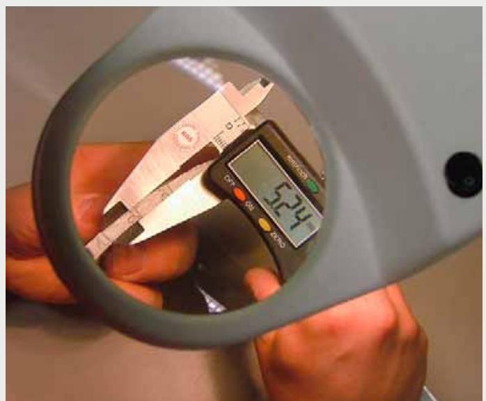
Figure 3: Measurement of liner-wall thickness