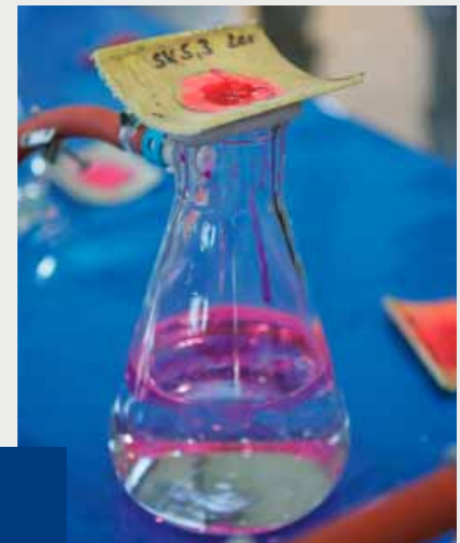
Figure 4: Tightness test