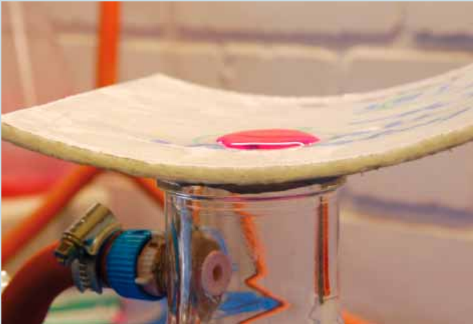
Tightness testing: liner tight