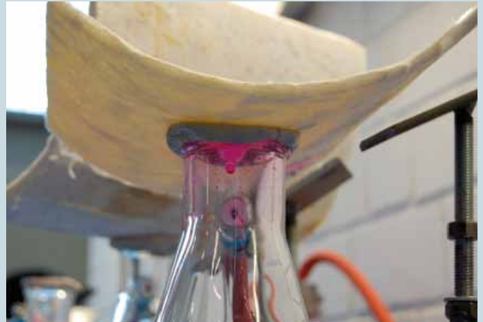
Tightness testing: liner not tight