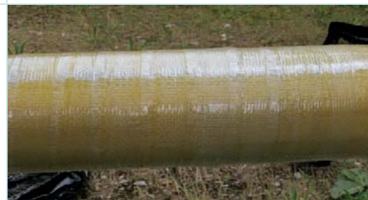
▲ BB protect after curing