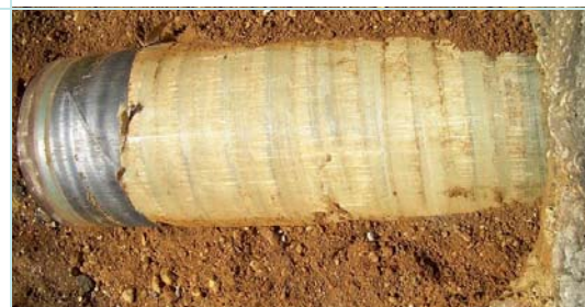
▲ BB protect after insertion into the ground

Brandenburger Liner GmbH & Co. KG Taubensuhlstraße 6 D- 76829 Landau/Pfalz, Germany Tel. +49 63 41 / 51 04 -0 Fax +49 63 41 / 51 04 -155