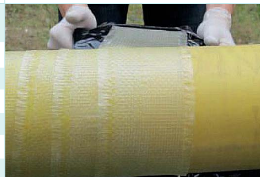
▲ Applying the product to the pipe to be wrapped